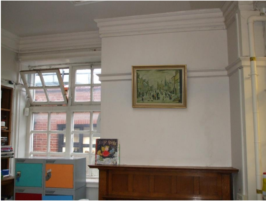
Office above fireplace and ceiling.