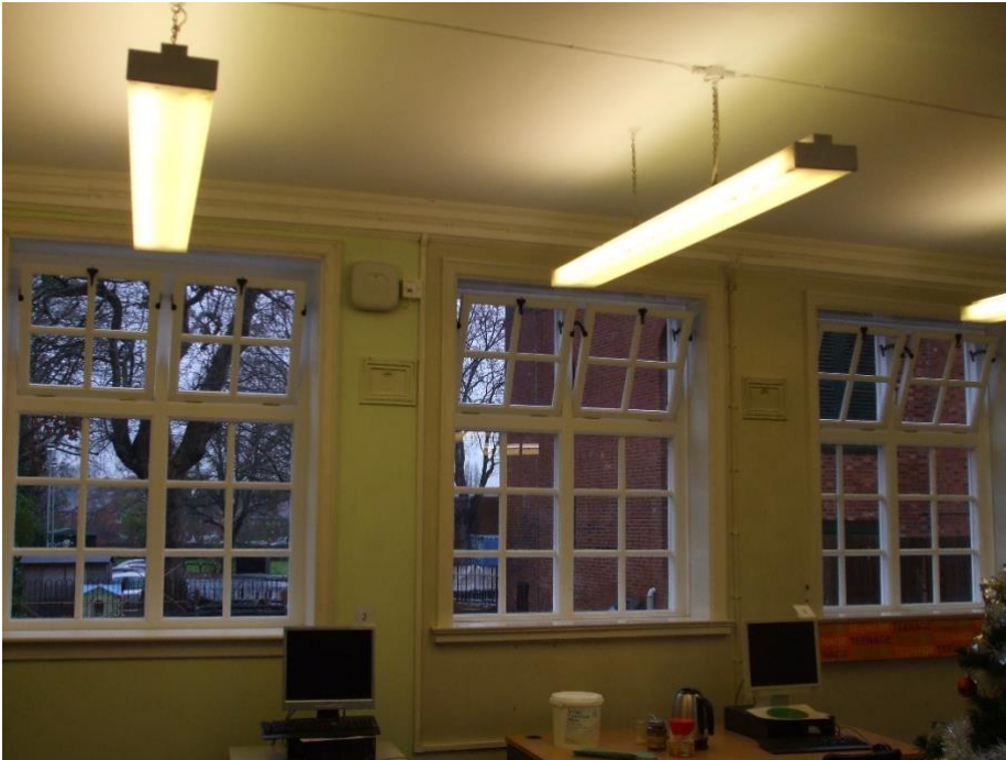
New windows from inside

We have had some new windows at the rear of the main/central Library area. These have been useful in helping with the increased ventilation necessary to help prevent the spread of the virus.