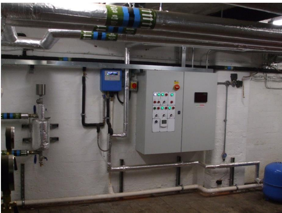
New control panel