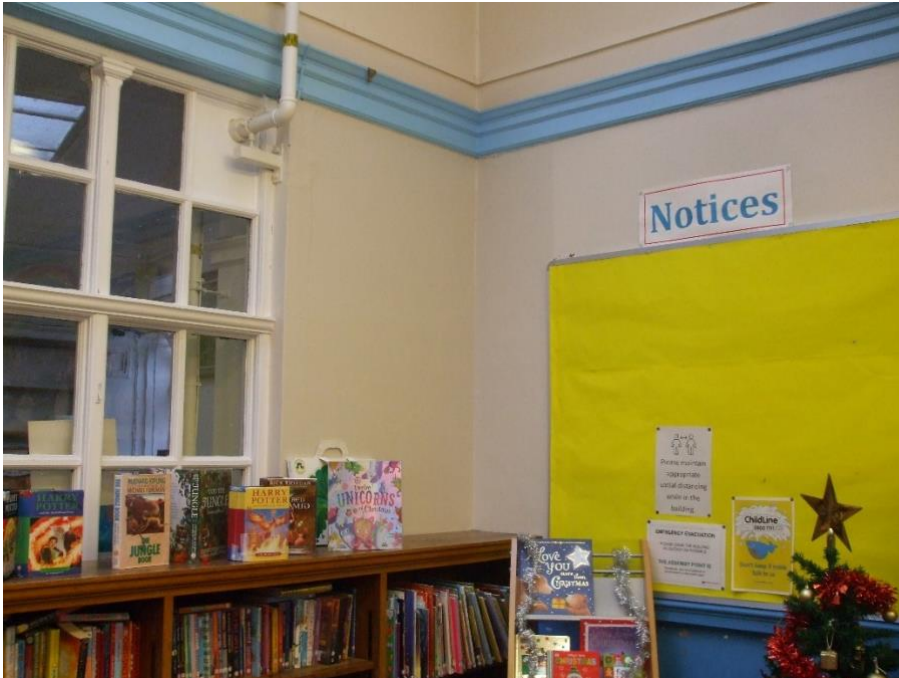
Children's Library Corner

Some paintwork has been refreshed on the inside of the building. This includes patches that have had paint peeling and hanging off such as the Children's Library in the corner and the ceiling, the Office and the ceiling of the Foyer area. In the Foyer area there were cracks in the plaster on the half landing wall above the main door, and upstairs on the wall of the landing. The plaster has been repaired and the areas have been repainted.