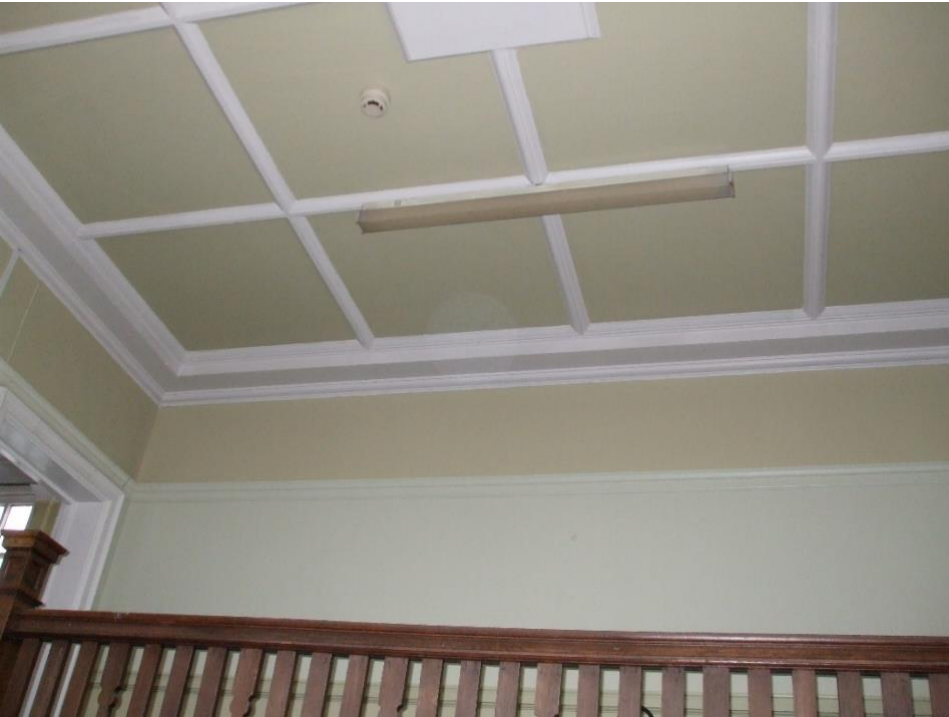
Upstairs Landing wall – plaster and repaint and ceiling repaint