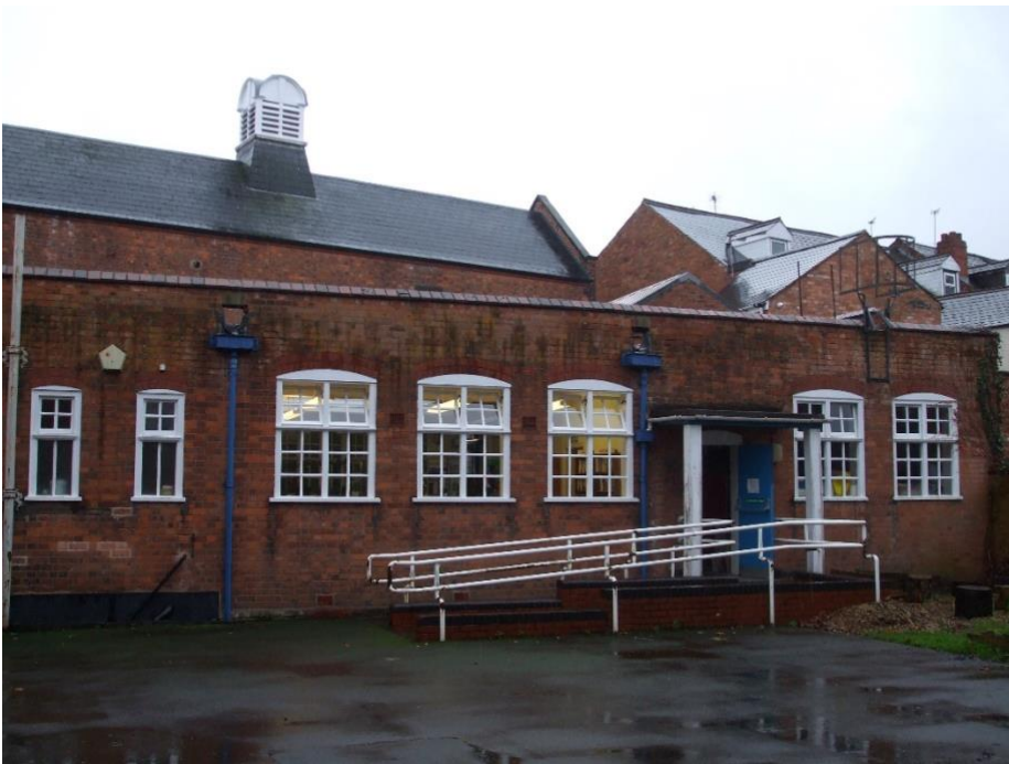
New windows and older windows all repainted from outside.