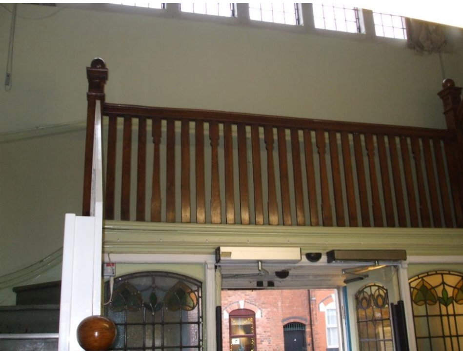
Half landing wall in Foyer – plaster and paint