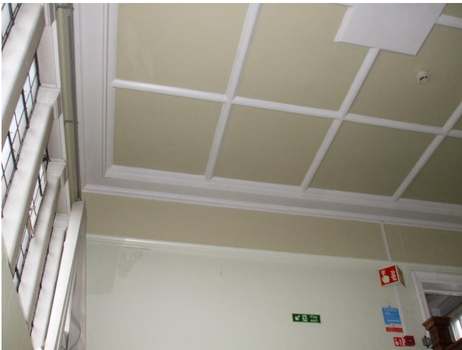
Foyer ceiling and above picture rail - repaint