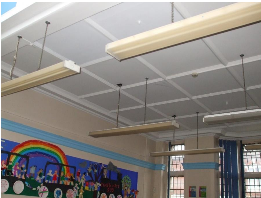
Children's Library Ceiling